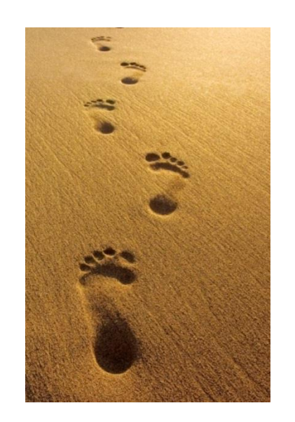
Footprints in the Sand <a href="https://www.youtube.com/watch?v=Xc5EKXTI3O0">https://www.youtube.com/watch?v=Xc5EKXTI3O0</a>

"As for those who believe and do right actions, the All-Merciful will bestow His love on them." (Qur'an, 19:96)