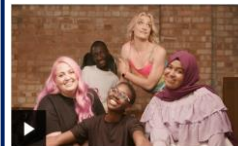
Celebrating my identity

https://www.bbc.co.uk/bitesize/articles/z7q3hbk